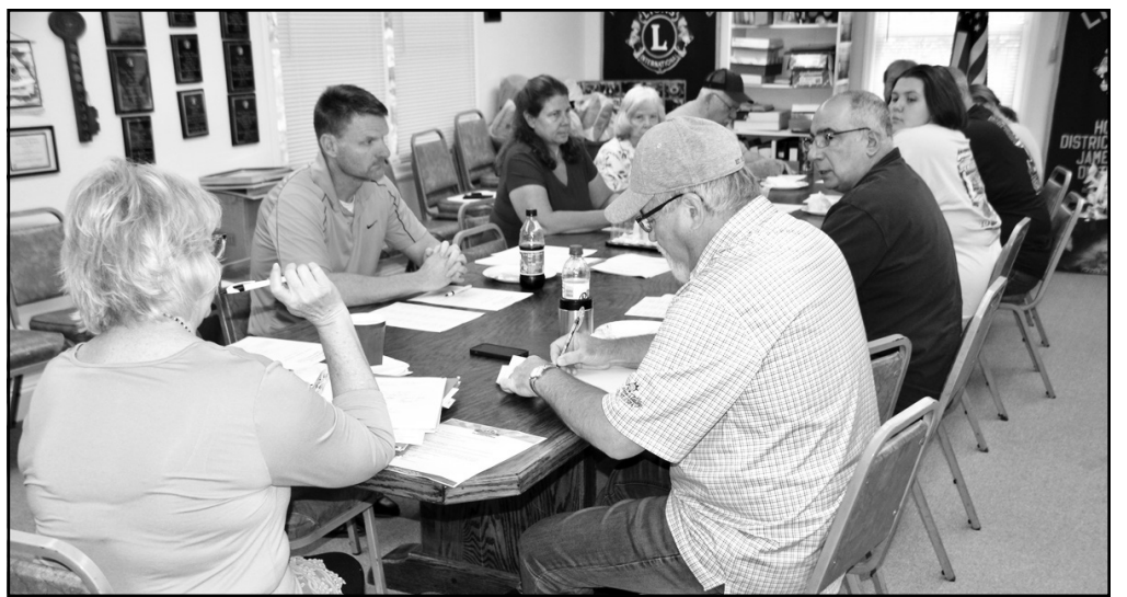
The Georgia Mountain Fair Parade Committee met for the first time in 2020 on June 2 to talk about plans for the 70th anniversary parade.

The 70th anniversary fair will take place later in the year than usual because the fairgrounds will be hosting a new carnival in 2020, which will feature bigger rides and other improvements.